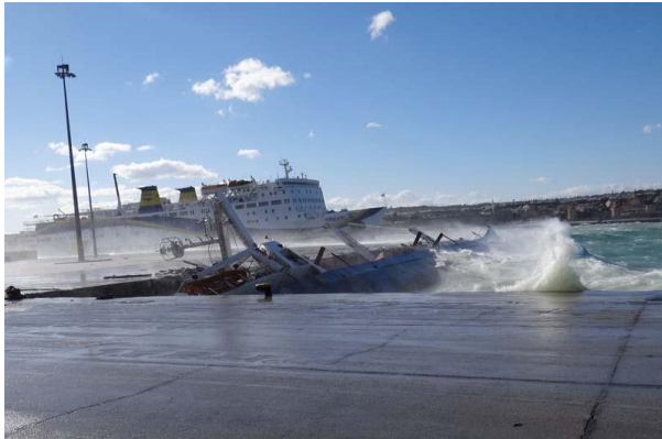
Figure 15. Nour M sinking.