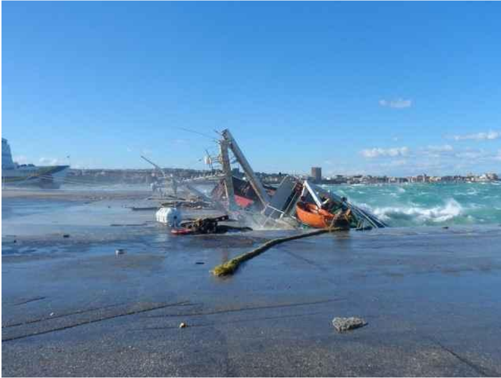
Figure 14. Nour M sinking (source local press).

At approximately 1230, she was finally sunk at “Dorieas” dock wall at a depth of approximately 7 meters (figure 14).