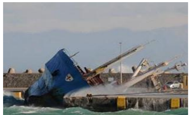
Figure 13. Nour M has listed to port.