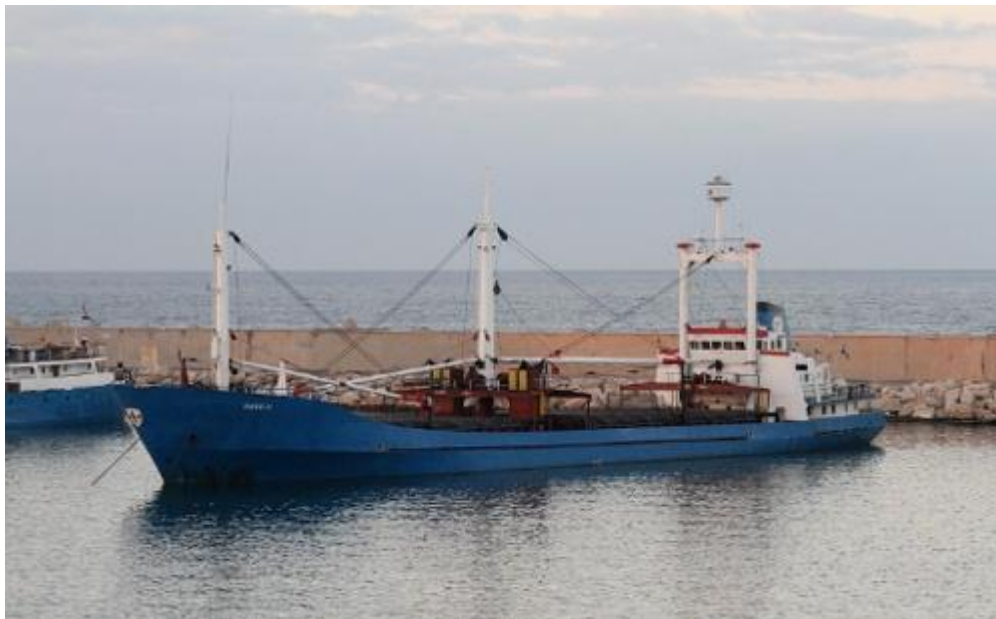
Figure 3. M/V Nour M

General cargo Nour M was build in 1972, in Denmark. She was a two holds freighter, geared with two derricks with a carrying capacity of 2,662 tons of bale cargo or 3,044 tons of grain cargo as well as with a container carrying capacity (Figure 3).