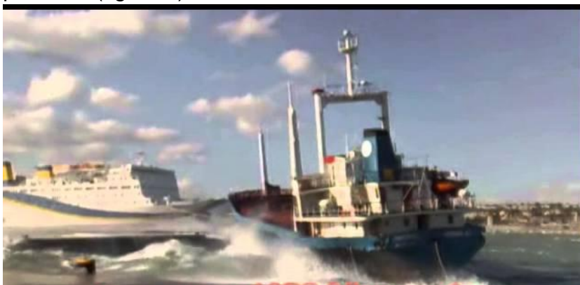
Figure 8. Nour M by the time her port bow impacted on Dorieas dock. ROPAX Prevelis seen berthed at the next docking arrangement.

At approximately 1000, NOUR M while under strong drift by the prevailing weather conditions in the port, impacted on “Dorieas” dock and was hauled alongside with her port side (figure 8).