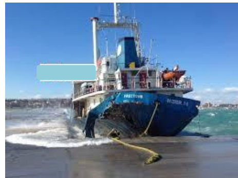
Figure 10. Nour M hitting on the dock under heavy rolling