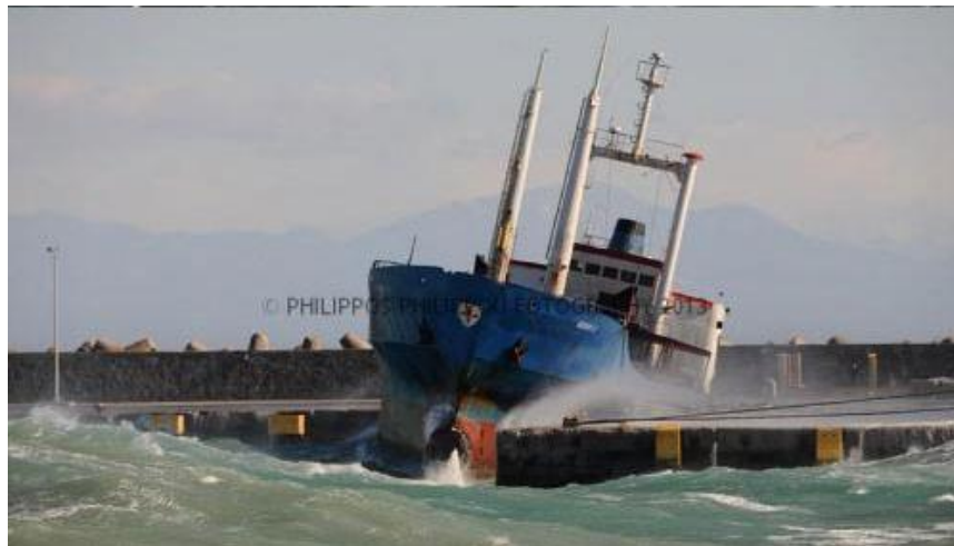
Figure 11. Nour M hitting on the dock under heavy rolling (source local press).