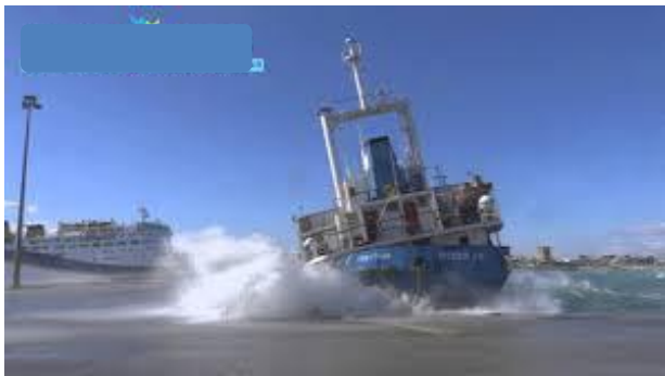
Figure 9. Nour M hitting on the dock.

NOUR M continued hitting the dock under heavy rolling and eventually started listing to port due to water ingressing into her engine room through the extended cracks below and over the waterline as well as through cargo holds (figures 9, 10, 11, 12 & 13).