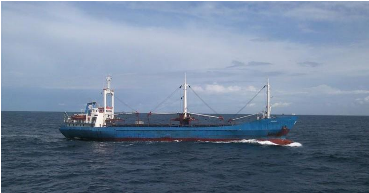
Figure 1. Cargo vessel Nour M

M/V Nour M was a general cargo vessel trading in the Black Sea and Mediterranean Sea under Sierra Leone Flag (figure 1).