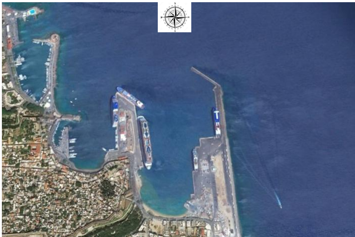
Figure 7. The port of Rhodes topography, opened to Northerly winds (source google earth).