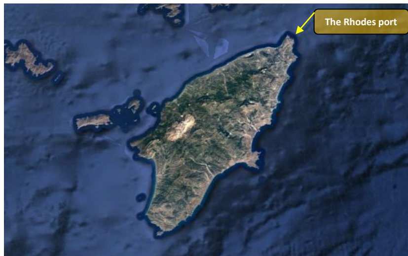
Figure 6. The Island of Rhodes and its port located at its northend.

The port of Rhodes (figure 6) due to its topography and its entrance open to North directed winds (figure 7) is affected as the wind force of open sea is hitting the port, while depending on its direction the encountering waves in the port may be significant high affecting moored vessels safe berth.