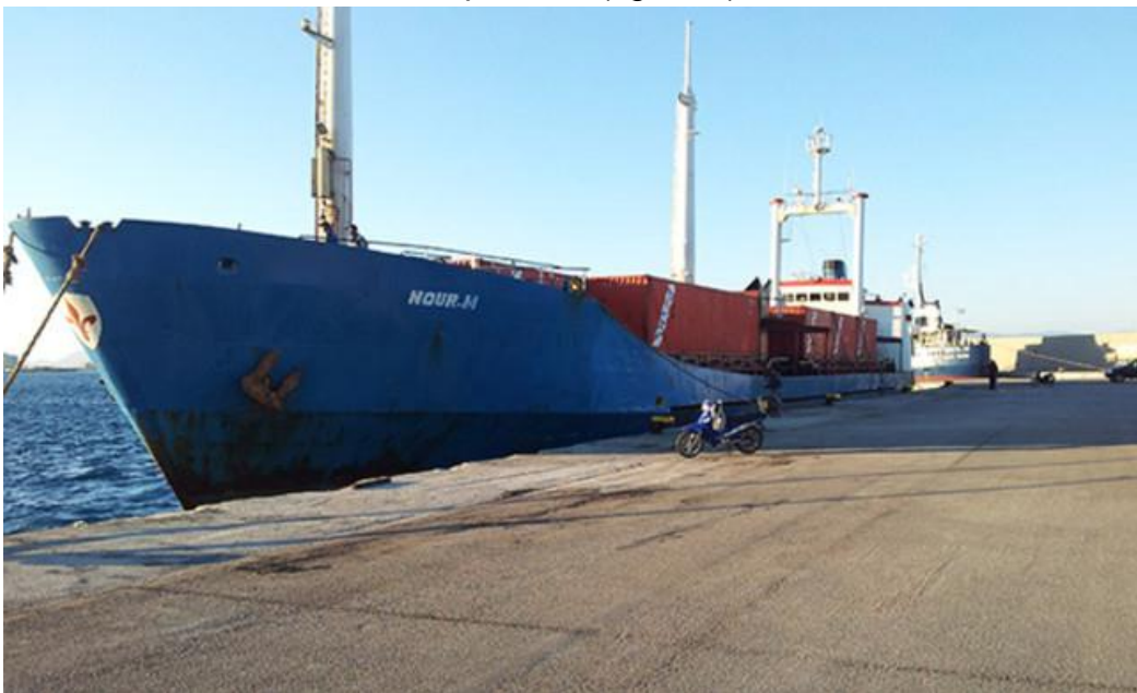
Figure 5. Nour M loaded, berthed at Colossos commercial port, in Rhodes.

On the same day, Nour M was instructed by the Local Coast Guard Authority to proceed in the port of Rhodes for inspection and control purposes where she berthed alongside “Colossos” commercial dock with her portside (figure 5).