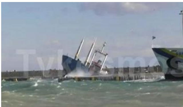
Figure 12. Nour M eventually listing to port.