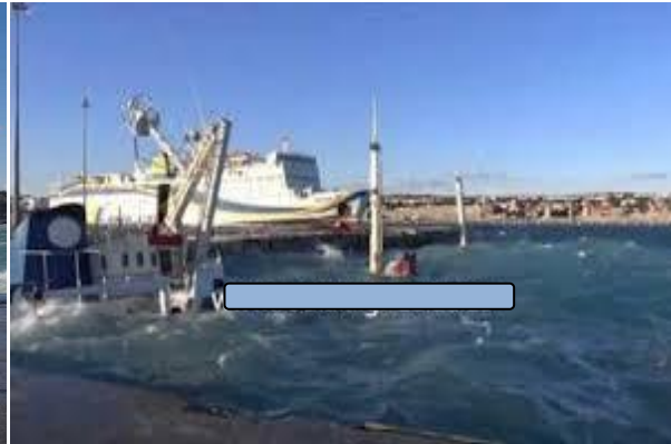
Figure 16. Nour M sank at “Dorieas” dock wall.

On 12 November 2013 the weather conditions were improved and oil containment booms and antipollution materials were deployed around the sunk vessel.